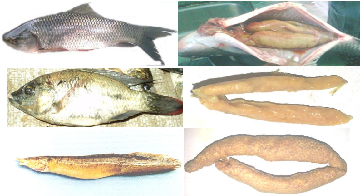
IMAGES SHOWING EXPERIMENTAL FISHES AND THEIR MATURE OVARIES